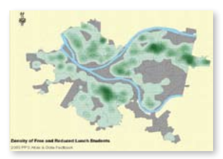
Sample analytic map showing where impoverished students reside.

UCSUR has decades of experience in applying GIS technology to many situations. Our efforts have consistently withstood the test of time and post-project scrutiny. Refer to our Web site for specific examples: www.ucsur.pitt.edu