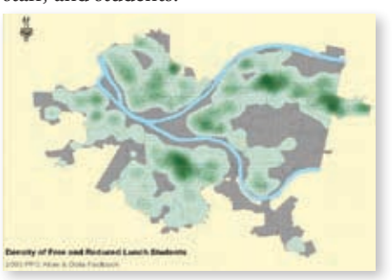
Sample analytic map showing where impoverished students reside.

transcription lab and a 10-station coding lab which utilizes ATLAS.ti, a PC-based workbench that supports project management, enables multiple coders to collaborate on a single project, and generates output that facilitates the analysis process. On the QDAP web site, we support the Coding Analysis Toolkit (CAT), a webbased suite of tools which facilitates efficient and effective post-coding analysis of qualitative data. In addition, we offer ATLAS.ti and CAT training seminars and one-on-one training sessions for faculty, staff, and students.