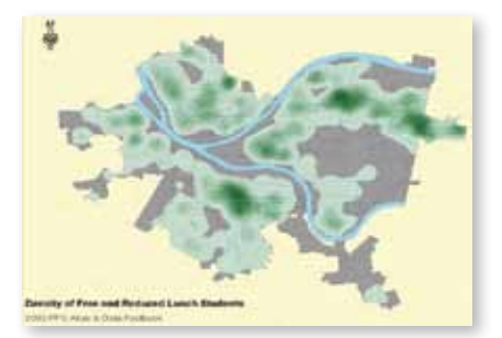
Sample analytic map showing where impoverished students reside.