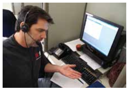
Interviewing and Data Collection

SRP conducts local, regional, and national telephone and mail surveys with both general and special populations, as well as in-person surveys in the Southwestern Pennsylvania region. SRP also conducts internet/Web-based surveys.