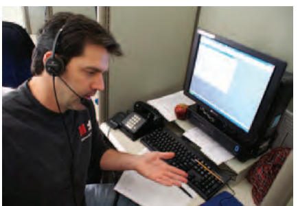
Interviewing and Data Collection

SRP conducts local, regional, and national telephone and mail surveys with both general and special populations, as well as in-person surveys in the Southwestern Pennsylvania region. SRP also conducts internet/Web-based surveys.